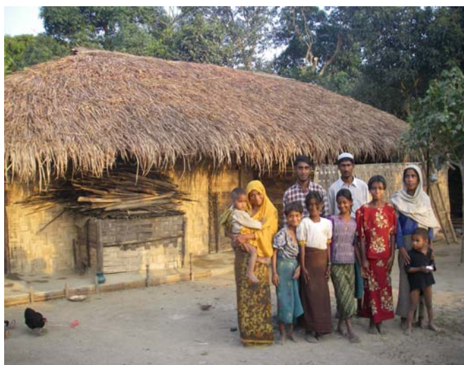
Provision of shelter construction materials in NRS

A family in Kha Maung Seik village, who could build a new house with CERF support