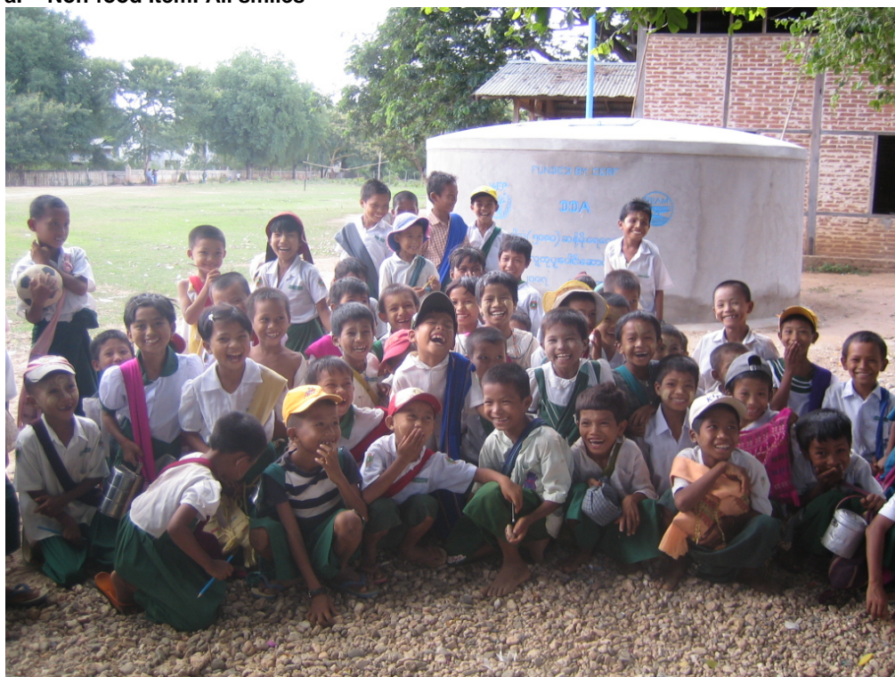
Smiling school children happy that they have a clean water supply at their school, Kway Ah Twin village, Pauk Township.

The use of water and sanitation facilities have been promoted for 90 boys and 70 girls attending the primary school at Khwe Ah Twin village, Taung Myint Village Tract in Pauk Township following the construction a ferro-cement rain water collection tank of 5,000 gallon capacity and one double unit fly-proof latrine in time for the school season in June 2007.