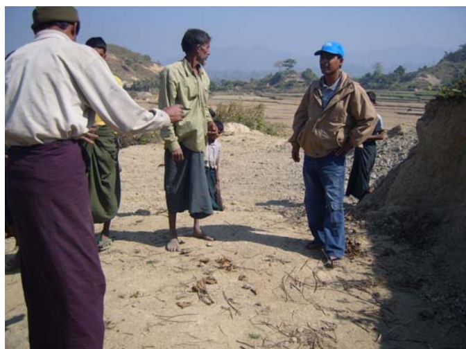
Protection Monitoring (UNHCR)

UNHCR staff on protection monitoring trip in Maungdaw North