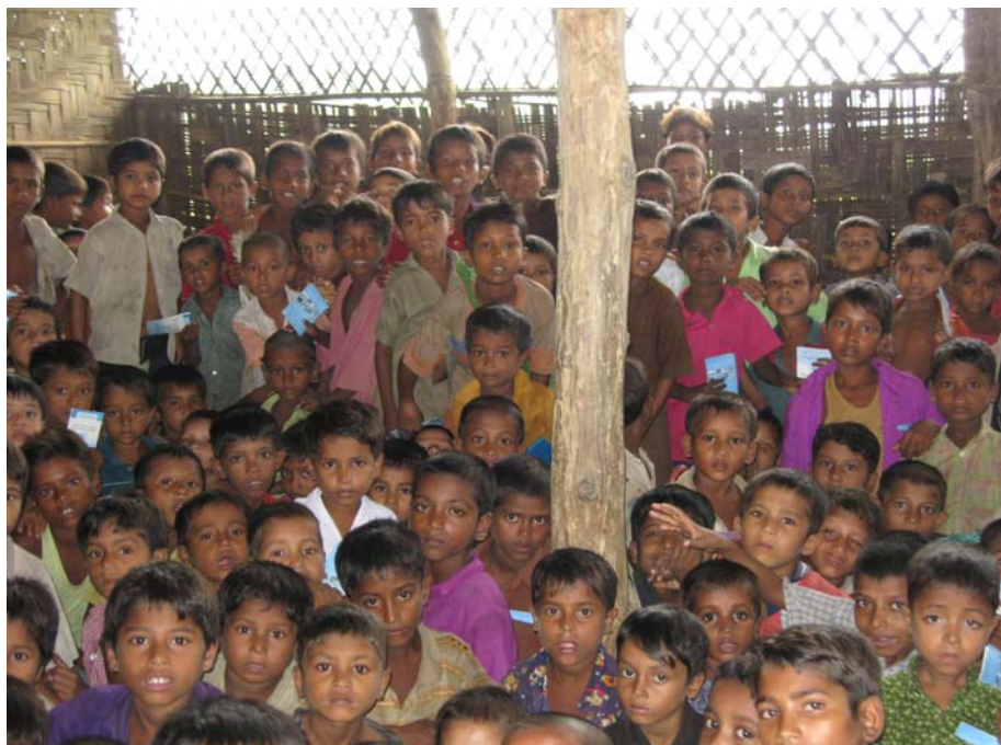
School children ready to collect take-home ration in Let Wei Dat Pyin Shay Primary School in Buthidaung

Access to education is a fundamental right of every human being and it is one of the most effective means of breaking the poverty cycle. Achieving universal primary education is amongst the MDG goals that WFP is striving for. WFP's food for education programme not only addresses the increase in enrolment and attendance of the students but also address the hardships experienced during the lean season. However due to pipeline break caused by the funding gap, WFP has to skip the monthly FFE distribution for two months in September and October. This has adversely affected the already impoverished community whose coping capacities are significantly stretched.