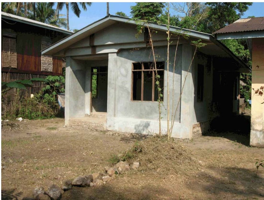
Construction of one of the UNHCR Rural Health Sub-centres in Southeastern Myanmar..