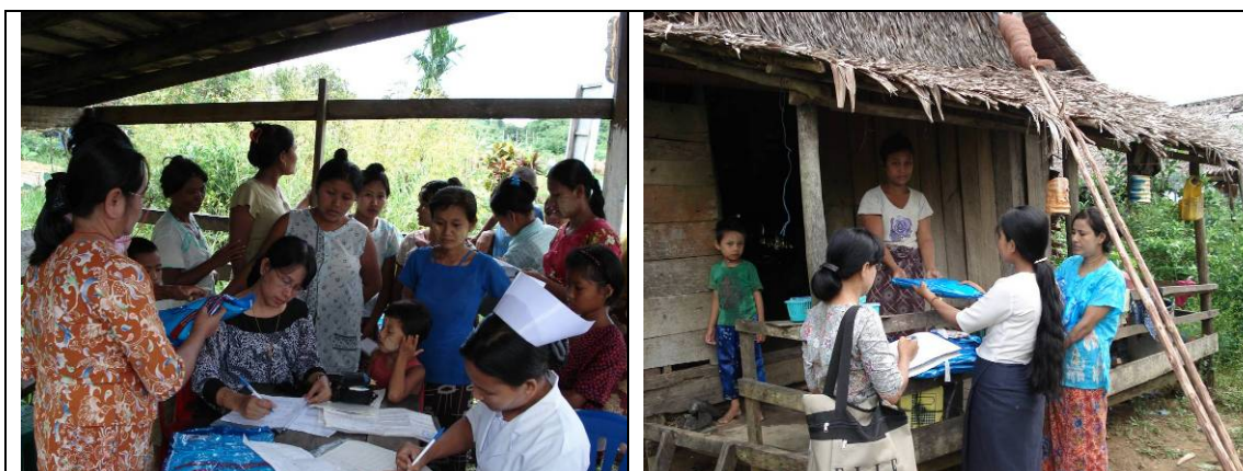
A team consisted of malaria control staff and local health workers visited the high risk villages and distributed LLINs either through distribution session (left) or household visit (right).