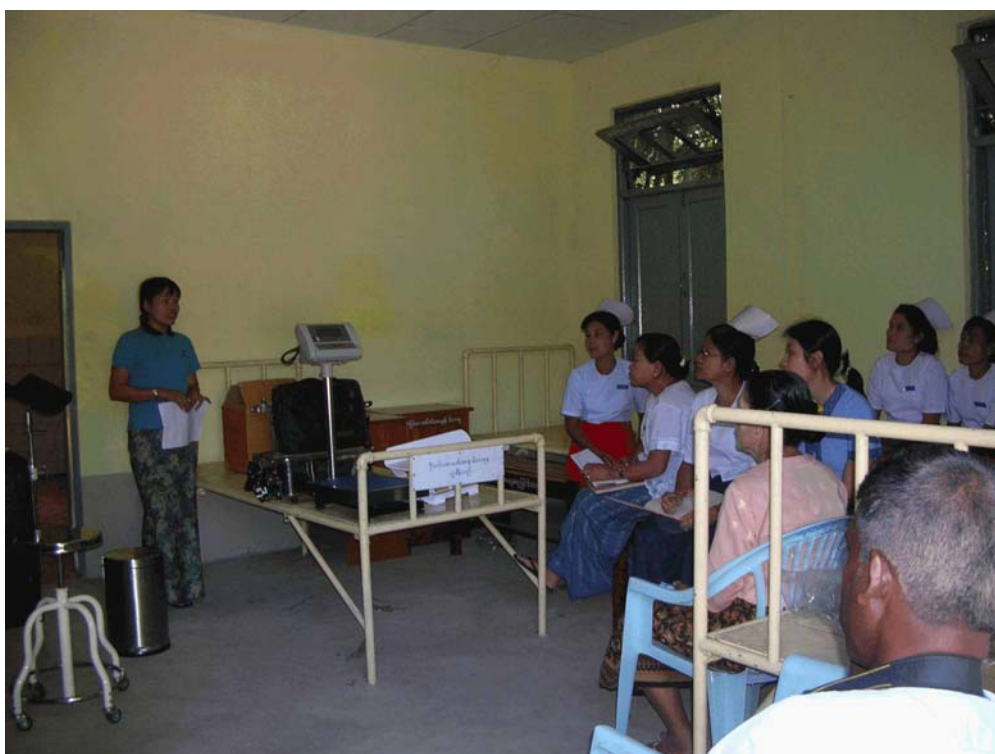
National UNV Nurse training medical staff on use and maintenance of basic medical equipment for RHSCs in Southeastern Myanmar. The user instructions were combined with basic hygiene training.